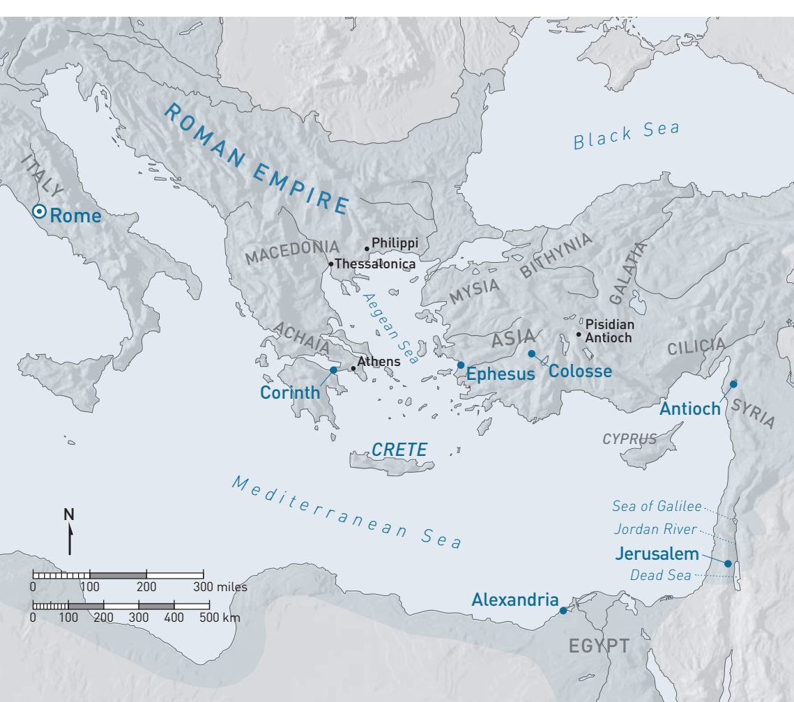
The people who originally received and heard Hebrews were most likely living in Rome. The author is anonymous, and he could have been writing from a variety of places where other Christians gathered, perhaps one of the cities highlighted above in blue.