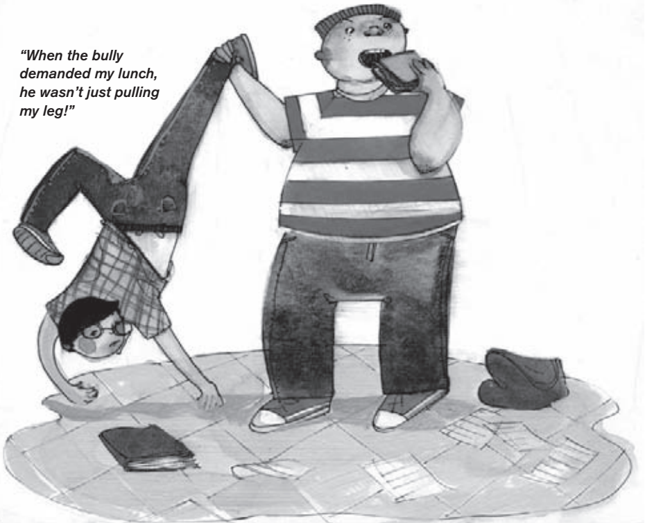
"When the bully demanded my lunch, he wasn't just pulling my leg!"

Dear God, please help me to be careful in what I say and not hurt others with my words.